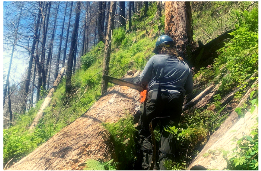
Last week, the trail crew removed 20 logs along 11 miles of loop hikes near the recently opened Larch Mountain Picnic Site