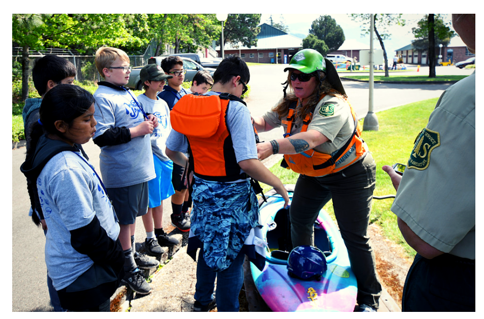
Local kids get lessons on River Safety at Water Jam 2019!