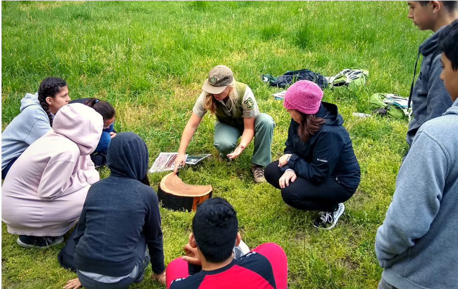
Field Rangers engage with school groups at Sandy River Delta