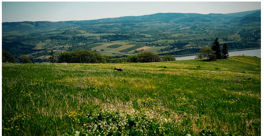
Coyote spotted on upper trail system of Coyote Wall