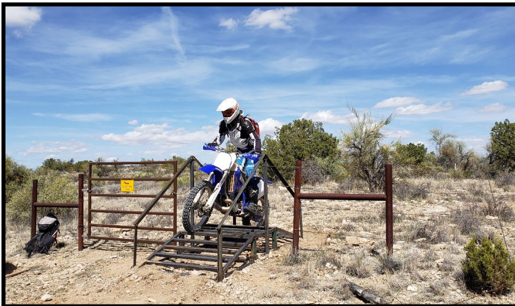
The first CTR motorcycle rider to use a newly installed cattle guard ramp.

The White Hills project was completed in the spring of 2019 and provides 28 miles of new motorized single-track on the Red Rock Ranger District. The White Hills project took two years to finish and achieved a variety of goals including heavy maintenance of existing trail, new trail construction, and social trail rehabilitation. The White Hills single-track, located about 4 miles east of Cornville, AZ, is the first motorized single-track on the Red Rock District and fills an important need for motorized trails in the Verde Valley.