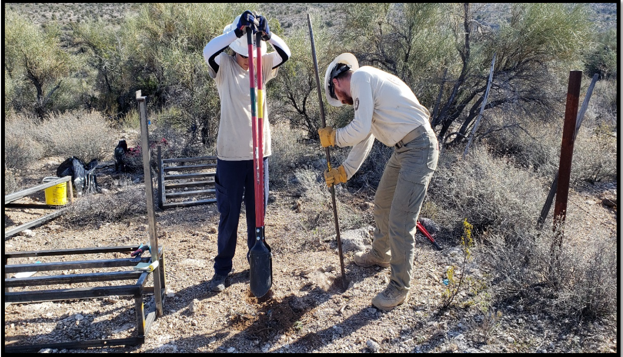
ACE working on cattle guard installation.