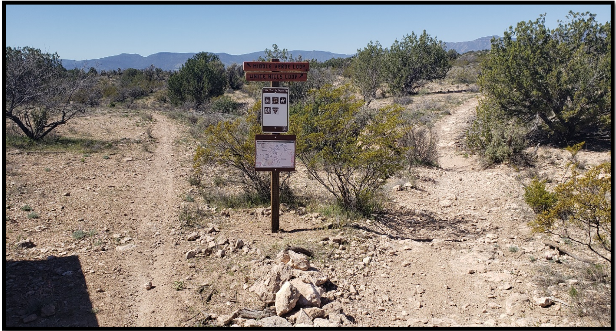
Trail signs/markers were installed at trail junctions and trail entrances with maps and locations.