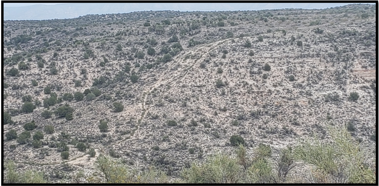
1.5 miles of Grandpa's Wash was rehabilitated and rerouted to move the trail on to a sustainable alignment.