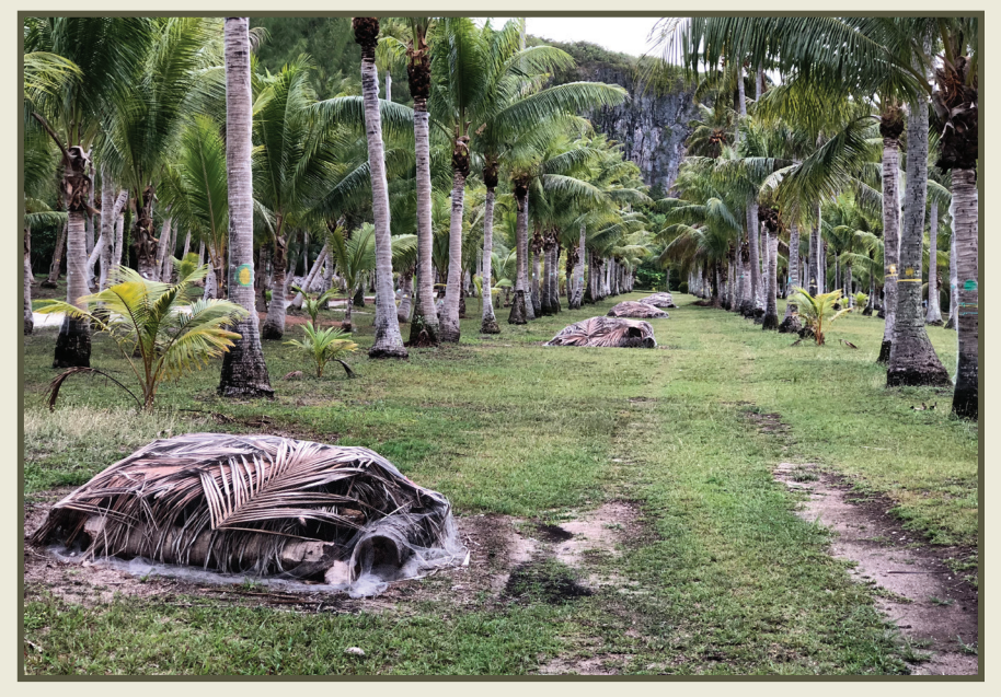
Figure 2. Piles of coconut palm material covered with tekken netting serve as a CRB surveillance trap.

Typhoon Dolphin in 2015 triggered the current upsurge in the CRB population on Guam. It was not a very strong typhoon by Guam standards, but it was the first one in more than a decade and caused more damage than expected. Abundant piles of decaying vegetation became CRB breeding sites. Some of these new breeding sites were in villages where they could be managed, but most were inaccessible in jungles and/or on military land. Within a few months, massive numbers of CRB adults were emerging from breeding sites and severely attacking palms which started to die. Prior to Dolphin, some heavily damaged palms were observed, but very few dead ones. It is now estimated that CRB has killed over 25% of Guam's coconut palms, with another 30-40% attacked and damaged. It is possible that up to 80-90% of the palms could be killed.