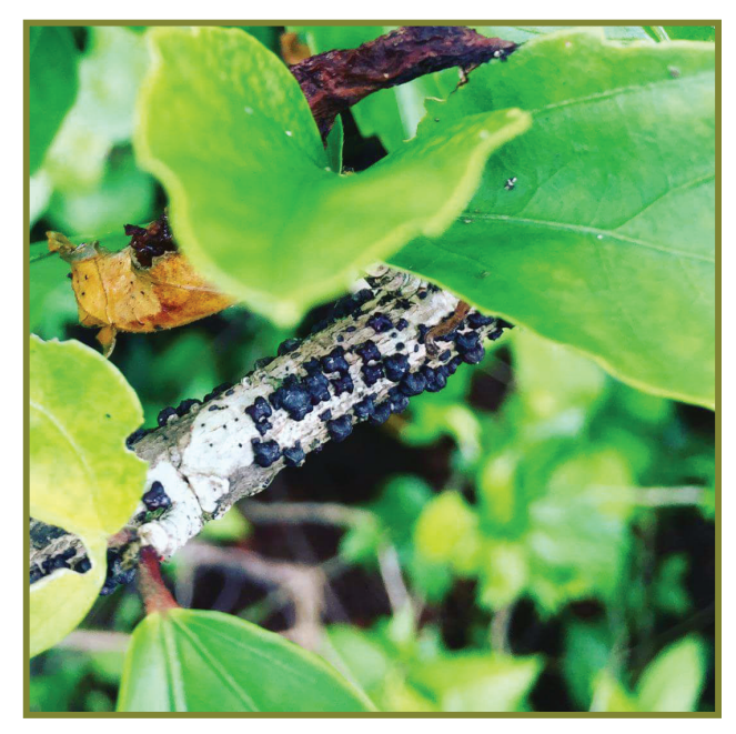
Figure 4. Lobate lac scale on a tree branch on Guam.

A newly detected wax scale ( Ceroplastes sp. most likely C. rubens ) was reported from the Marshall Islands in June 2018. Follow-up surveys are ongoing.