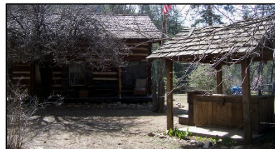
Palace Station's original condition

The work for both sites is in preparation for offering the sites as rental opportunities.