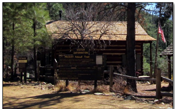
Palace Station's new roof and restored siding