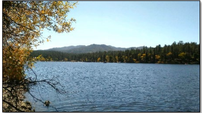
A day on Lynx Lake, Prescott AZ