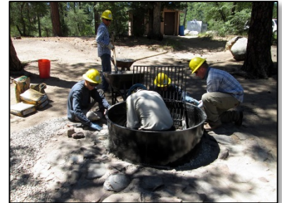
Teamwork is required to install new fire rings

The Forest used $71,995 in recreation fee funds to continue the work at Granite Basin Recreation Area. Yavapai Campground maintenance and repairs focused on fixing loose wheel stops, replacing wood edges around tent pads, and repairing retaining walls to address erosion issues. In addition, the Forest constructed 22 new tent pads, installed an accessible water hydrant, and replaced all the picnic tables and fire rings.