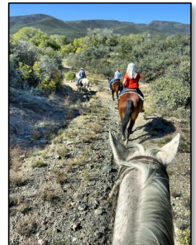
Trail Riding.

The Forest issued over a dozen recreation event permits, converting many of the long standing permits to 5 year permits. Major events included the 38 th Annual Whiskey Row Marathon, Epic Rides 8 th Whiskey Off-Road Mountain Bike Event, and the Annual Verde River Runoff.