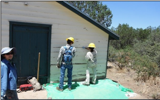
Youth crews remove old paint at Sycamore Barn

Built in 1938, Sycamore Cabin sits at an elevation of 4,000 near Sycamore Creek. In 2016 Yavapai County Youth Conservation Corps and the Arizona Conservation Corps contributed over 500 hours to maintain the historic structures. The volunteer crews scraped and painted the fencing and barn, installed a fire pit and BBQ grill, removed encroaching brush and trimmed trees.