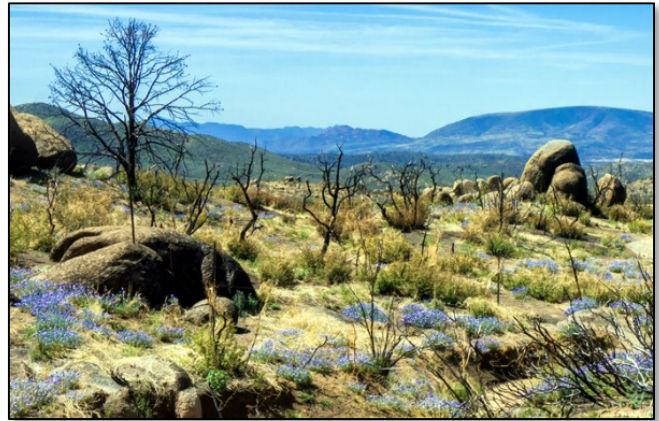
Granite Mountain Wilderness.