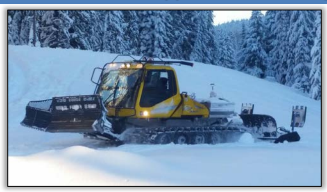
Snow cat grooming winter trails at Lolo Pass

Located on the Idaho and Montana State line, the Lolo Pass Visitor Center supports an enormously popular backcountry winter snowmobile and cross country ski trail system. In 2015 grooming of that system became in jeopardy when the existing groomers were no longer able to continue operations. However, the forest worked with a private donor to create an amazing web of partnerships to renew and improve the groomed trail system.