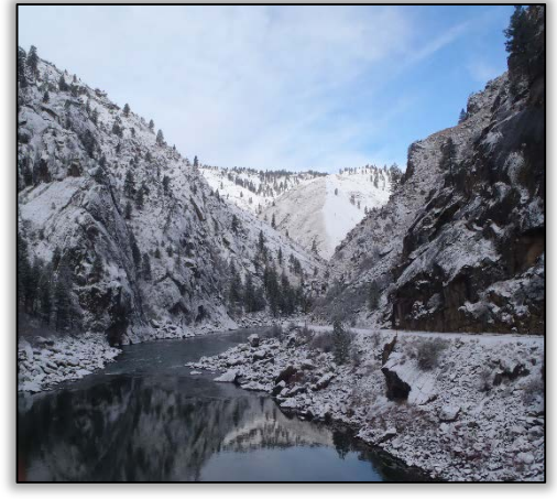
A float and jet boat river for all seasons