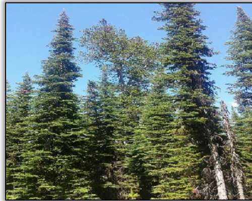
Iconic Whitebark Pine are found along trails maintained with outfitter and guide fees