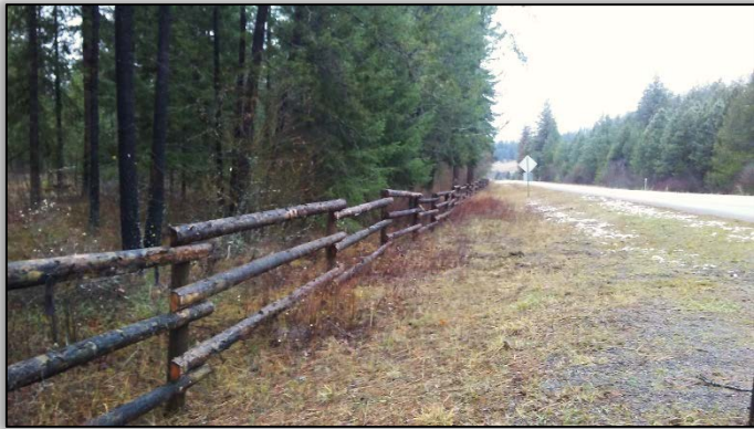
Sloway Campground split rail fence

The forest constructed a split rail fence to surround Sloway Campground in 2017 to protect the sites from free-range cattle. A portion of the fence had been constructed many years ago, however it was never finished. However, even that fence needed to be replaced as most of the old fence was rotten.