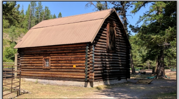
Monture Barn sanded and stained

The Forest used recreation fee funds to maintain three buildings at the Monture Cabin Rental. The main cabin, along with the barn and old pump house, were sanded and treated with stain to ensure long-term weather resistance.