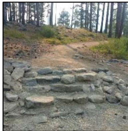
Native rock stairway constructed to a view point of Lake Como.