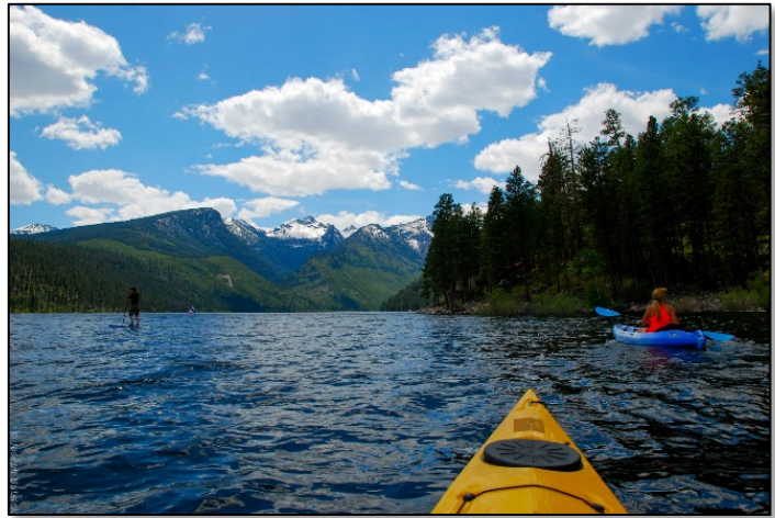
Recreating on Lake Como