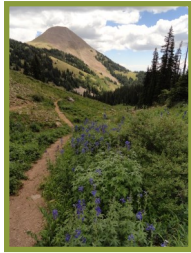
Photo: La Sal Mountains

The National Forest Management Act (NFMA) of 1976 requires that each forest create a land management plan. Known as Forest Plans, these land management documents guide management of National Forest lands to provide for multiple-uses and social, economic, and ecological benefits for the present and future.