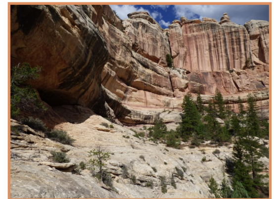
Photo: Dark Canyon Wilderness