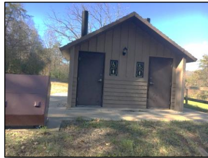
Satterfield Trailhead at Beasley Knob OHV Area

Satterfield Trailhead is one of two sites that provide access to Beasley Knob OHV Area, which is a popular destination for four wheel drive vehicles, AVTs/UTVs and dirt bike riders.