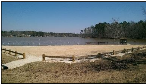
New sand at the Lake Sinclair Recreation Area