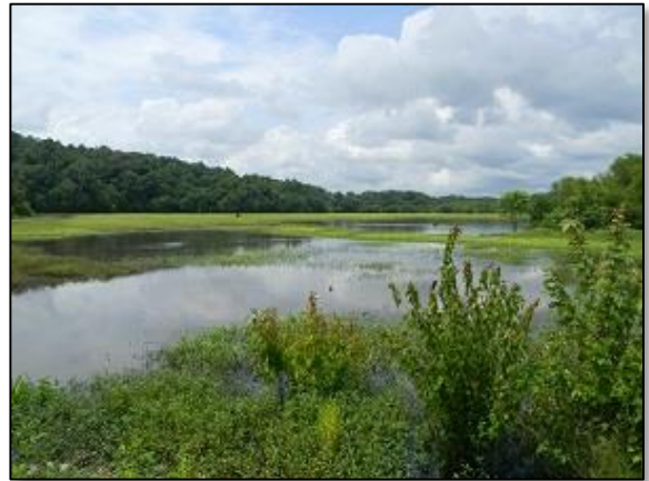
60 acre freshwater wetland created to provide healthy and sustainable waterfowl habitat