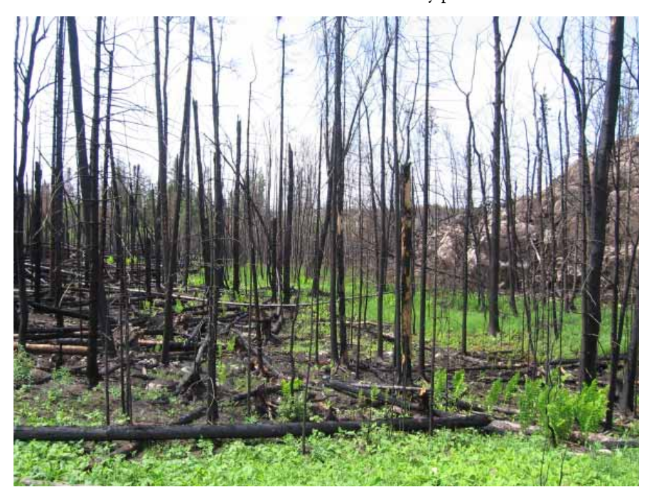
Figure 2—Areas of regrowth along the Gunflint Trail, BWCAW.

This study's sampling design was informed by previous BWCAW studies