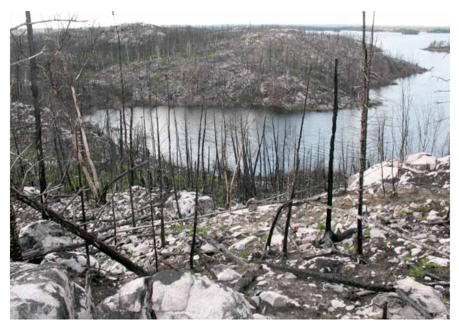
Figure 1—BWCAW area visited shortly after 2007 Ham Lake Fire.