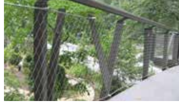
Cable mesh guardrail panels