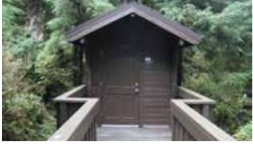
Existing toilet to be relocated