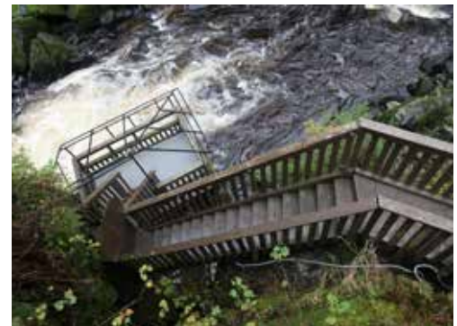
Photos of existing conditions