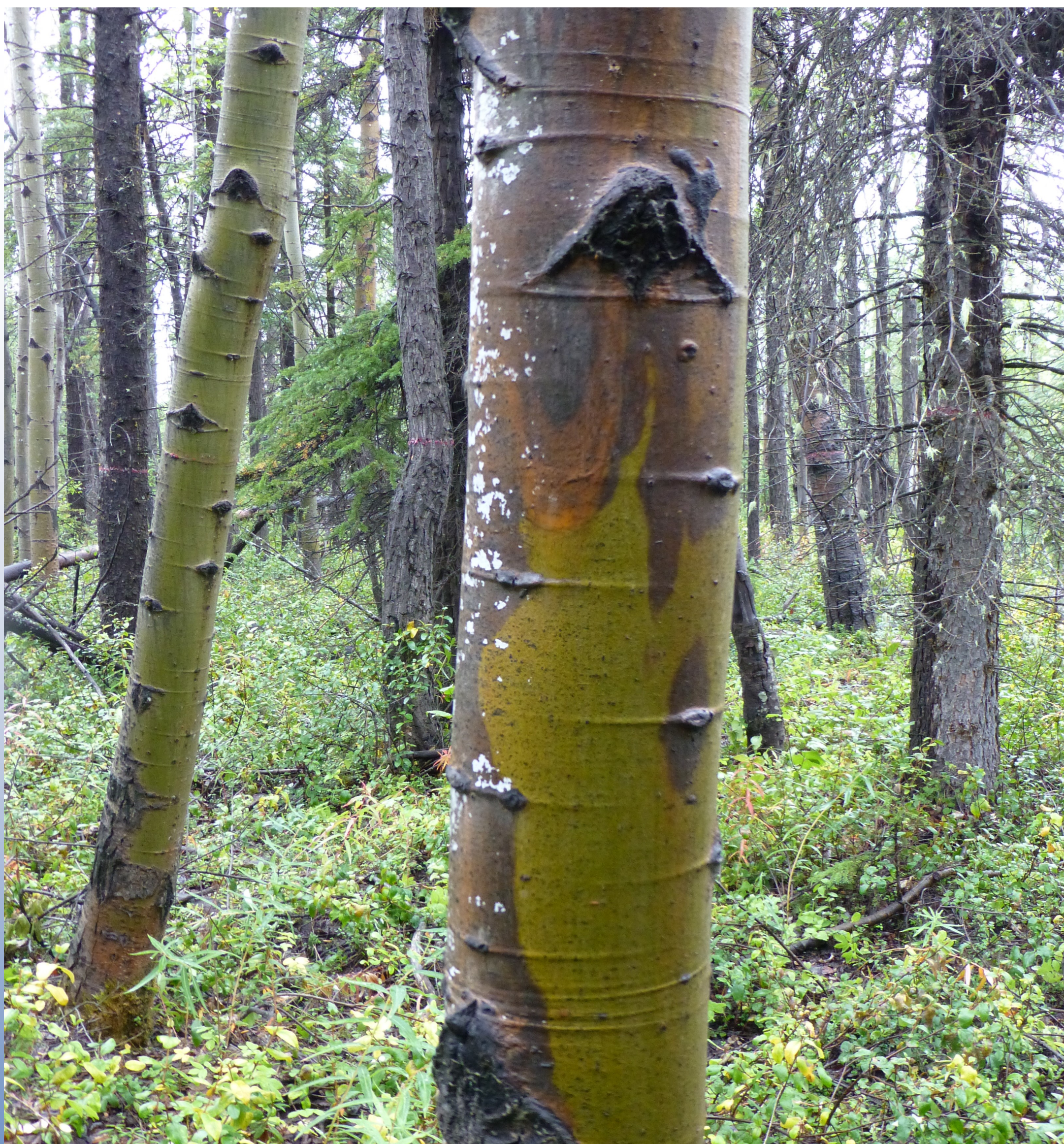
Aspen running canker aggressively runs along the bole and girdles trembling aspen in Interior Alaska. The top of the tree is dead. This disease can girdle and kill trees within a single season with no apparent host defenses.

Partnerships between long term monitoring programs and FHP professionals are enabling the construction of distribution maps for this and many more of Alaska's forest pathogens. These are now available at https://www.fs.usda.gov/detailfull/r10/forest-grasslandhealth/ . This data is compatible with the Forest Health Mapping and Reporting portal.