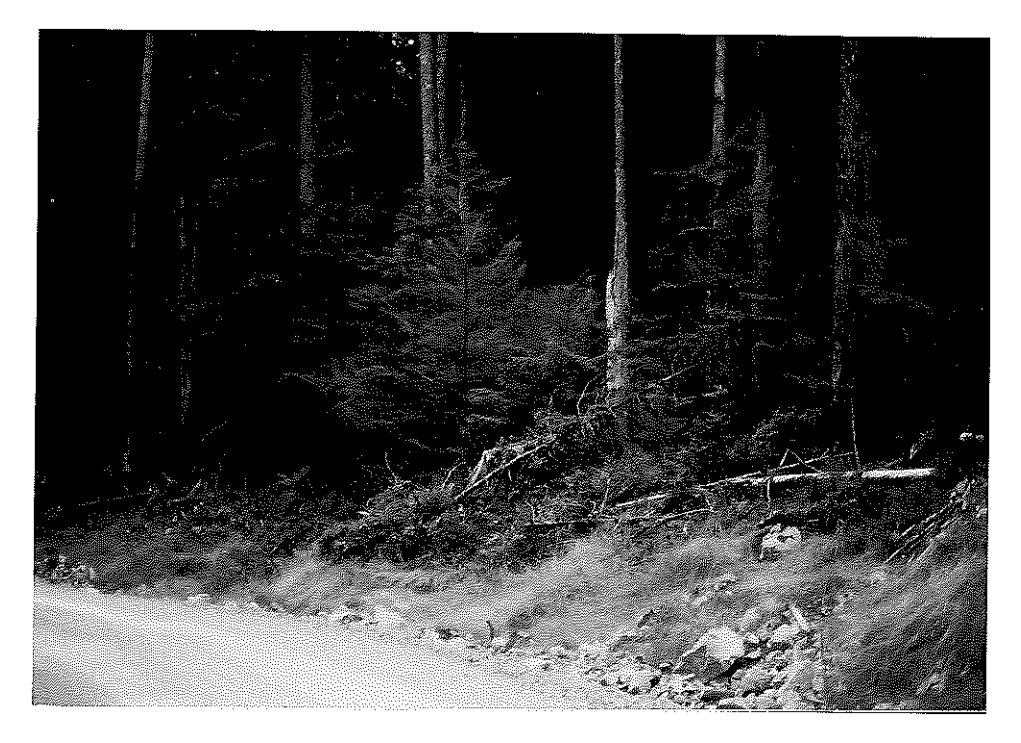
Figure 1. Hemlock canker kills small hemlock trees and the lower branches of larger hemlock trees along roadsides of Prince of Wales Island.