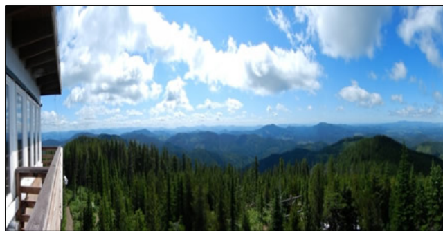
Bald Mountain Lookout has a tremendous view of the Forest's "sea of mountains"