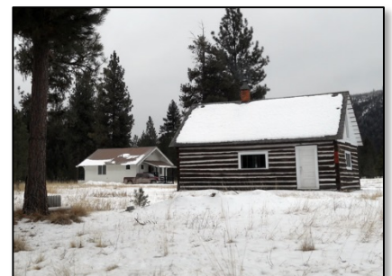
Historic Bend Guard Station.

Approximately $5,000 of recreation fee funds helped repair or replace splintered/deteriorated portions of the exterior deck and interior flooring.