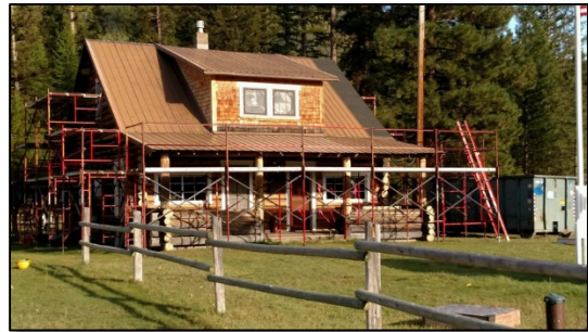
Work on roof at Monture

The Monture Guard Station serves as an administrative site for backcountry personnel and pack stock during summer and a cabin rental during winter. Snowmobilers, cross country skiers, and winter recreationists keep it 95% occupied. Approximately $3,000 of recreation fee funds supplemented $3,000 of facilities funds and salary costs to install a new roof and purchase new mattresses for the cabin.