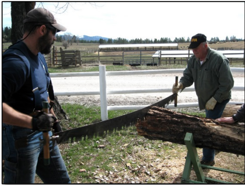
Students practice cross cut saw skills.

The Ninemile Remount Station was built by the CCC in the early 1900s. It features a nationally known training center for both agency and public use.