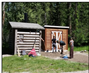
New wood shed (left) and gravel (bottom) at Swan Guard Station