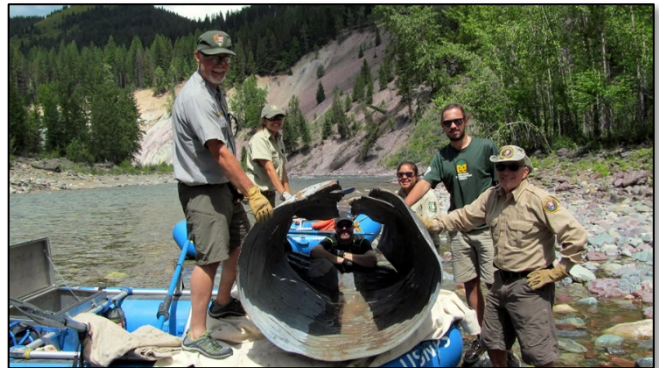
River Rangers worked with three partners to remove a culvert from the Middle Fork of the Flathead River.

The river ranger patrols provided public education and safety, and permit monitoring. They cleaned debris (human caused and natural) out of the river, and maintained and cleaned developed recreation sites along the river. Recreation fee funds also leveraged partner support with Montana Conservation Corp, Student Conservation Corp, Glacier National Park, and volunteers who also helped with the many river projects. Additionally, recreation fee revenue supported maintenance and improvement projects at 14 developed river access sites within its corridor.