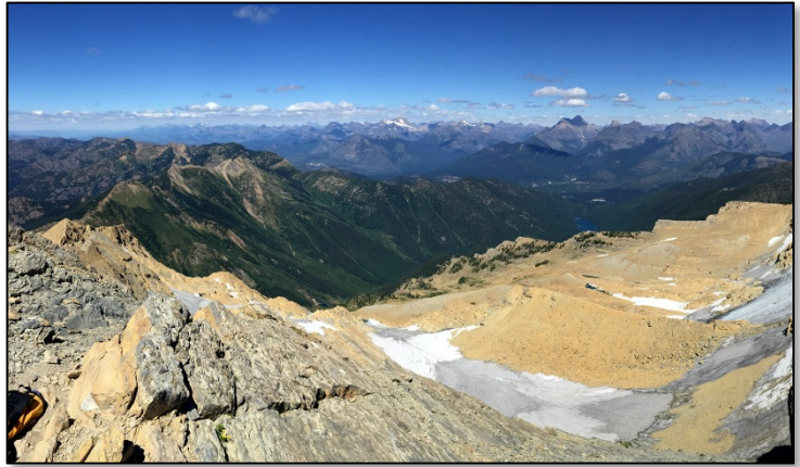
Alpine view in the Bob Marshall Wilderness Complex

The forest has 15 cabins in the cabin rental program. With the popularity of the cabin rental program, visitors typically need to make reservations months in advance. Use is high at almost all sites and normal wear and tear takes its toll on the site and furniture. In 2016, cabin rental revenue funded minor site upgrades and the purchase of new furniture across the forest cabin rental system. Approximately $20,000 was spent to make minor improvements to sites and purchase new furniture and amenities, including heaters, stoves, couches, tables and beds.