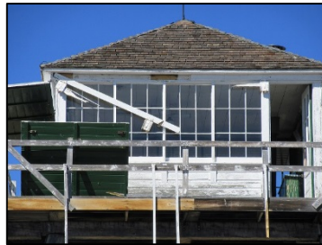
A pack string hauls shutters for Medicine Point Lookout.