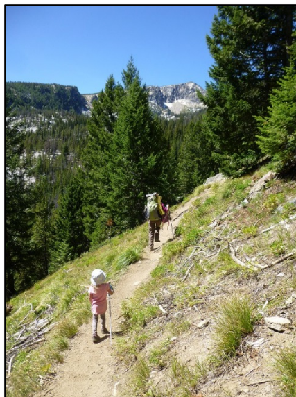
A young hiker enjoying one of the many trails in the Bitterroot National Forest.