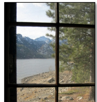
New screens offer better view of Lake Como

Current and future generations benefit as 80-95% of the funds are reinvested in the facilities and services that visitors enjoy, use, and value.