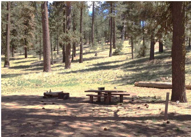
Pine Mountain Campground

To get here, follow Highway 33 to the turnoff at Pine Mountain Summit located 33 miles from the Ojai Ranger Station. Turn right and follow the paved road another 4.7 miles. Pine Mountain Campground will be to your right. Follow the road for another mile to get to Reyes Peak Campground. The total distance from Ojai Ranger Station to Pine Mountain Campground is 38 miles, and Reyes Peak Campground is 39 miles.