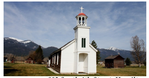
903 South 4th Street, Hamilton montanamemory.org

RML is a NIH research facility not open to the public. Informational displays can be seen by stopping in the Visitor Center and viewing the wall display and video monitor of research projects. Many historic buildings are visible from the street, and historic photos are available via the Montana Memory Project