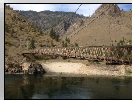
The Wind River Bridge serves as a trailhead to the Gospel-Hump Wilderness