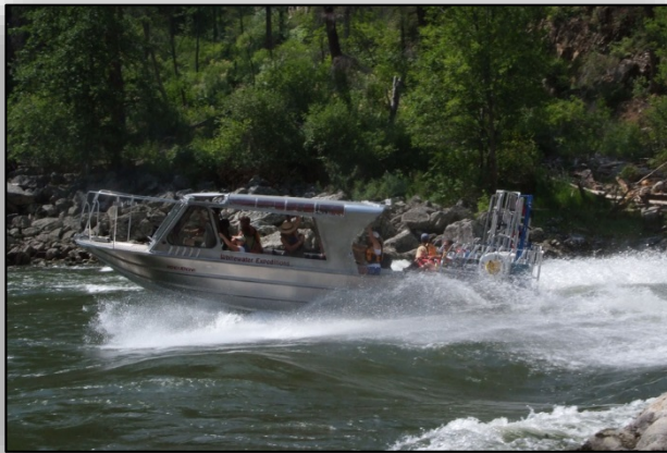
Jet boating on the wild and scenic Salmon River

Enjoying the Wild and Scenic Salmon River in a powerboat is a popular recreational activity. On June 1st, 2015, the Main Salmon Powerboat Permit system became available at www.recreation.gov . Before that, visitors could receive permits only by calling or visiting the Slate Creek Ranger Station during business hours.