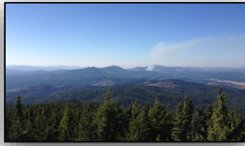
Many Campgrounds remained closed in 2015 due to fire