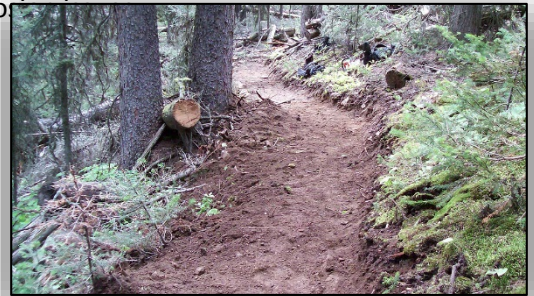
A representation of the type of trail work accomplished.

Recreation fee funds collected from outfitter and guide fees enabled about 40 miles of trail maintenance on the Helena District. This work included removing brush and downed logs, and repairing tread and water drainage. This work helps ensure trails remain open and minimizes erosion.