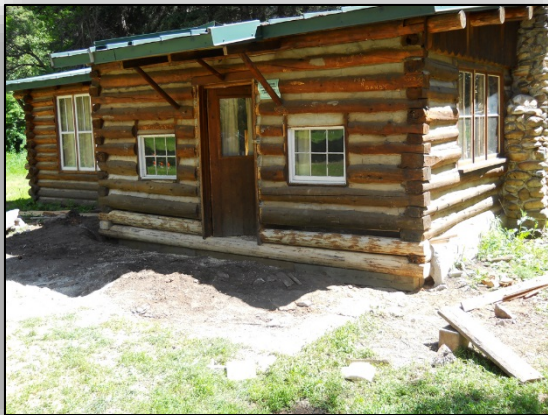
The Forests recently replaced decaying sill logs on Rilway cabin.

The Helena – Lewis & Clark National Forest has eight cabins that visitors can rent to have a rustic, yet comfortable experience in very remote areas. Renting these cabins helps retain the history of the Forest by keeping them on the landscape. Without rental and use, these cabins would almost certainly be in a state of slow decay and would eventually need to be removed as they would serve no purpose to the Forest or visitors.