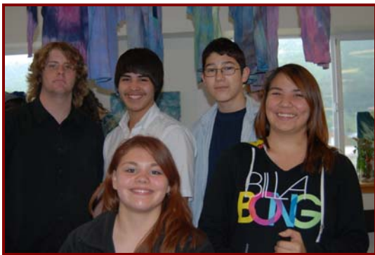
Craig School District's PACE students served guests and helped with set-up.