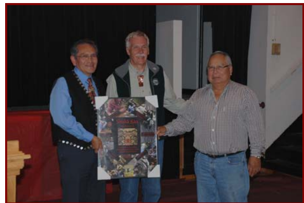
Secretary Schafer (center) presents a token of appreciation from the Forest Service to Sealaska Corporation Board members Ed Thomas (left) and Clarence Jackson (right).

Then the dancing began. The two dance groups that were guests at the