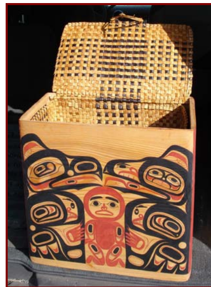
The bentwood burial box commissioned by Sealaska Heritage Institute.