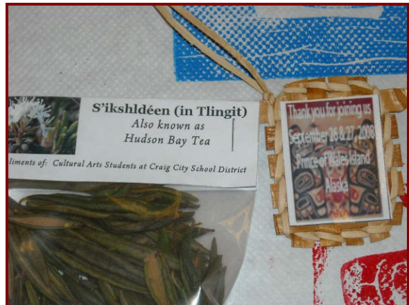
Gifts distributed to guests during breakfast, September 26.

As we ate our breakfast, students came around the room distributing to everyone presents that they had made: a bag of s'ikshld"een (locally grown Hudson Bay tea) with a label that had brewing instructions, and a bag of candies that had a label with the same artwork as the program cover. The gifts were compliments of the Cultural Arts Students at Craig City School District.