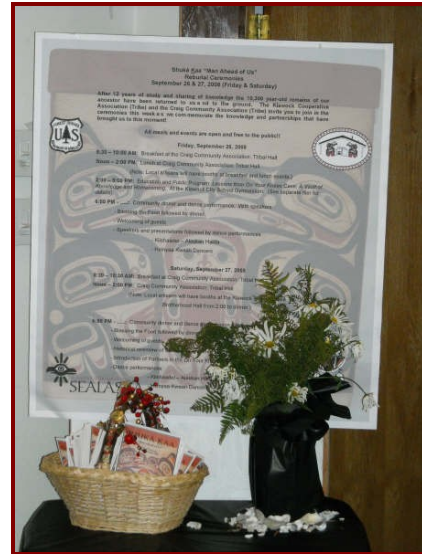
An enlarged event program was displayed in the Craig Tribal Hall entryway.

Southeast Alaska for this historic event, including dancers, community members, elders and leaders from Haines, Juneau, Petersburg, Cape Fox (Saxman) and Ketchikan.