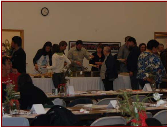
Forest Service employees serve Friday lunch at the Craig Tribal Hall.