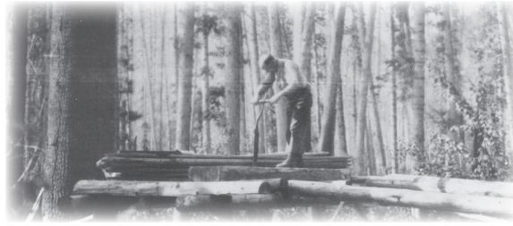
Whipsawing logs at the Lochsa Ranger Station, 1928.

The buildings at the Lochsa Historical Ranger Station were built primarily from native materials. Anything not locally available was packed in by horse or mule. Most of the original buildings remain in use today.