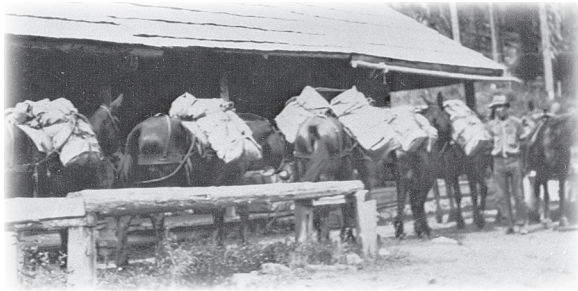
Mules being loaded in front of the Combination Building.