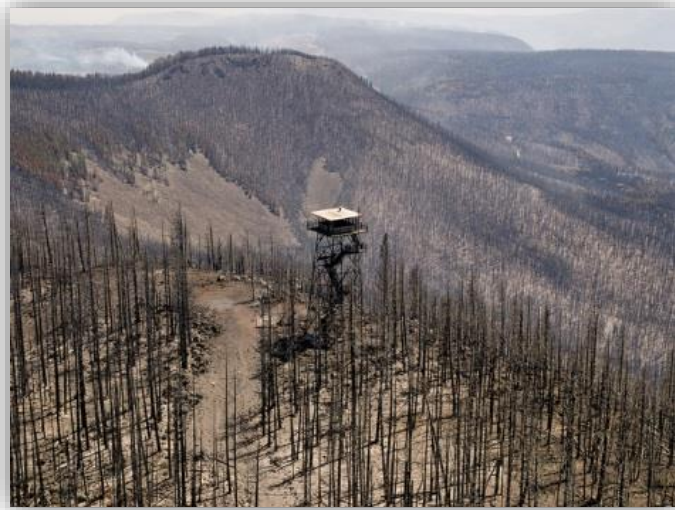
Wallow Fire burned over a half-million acres and significantly set back restoration efforts

Over the last five years, progress has been made despite contractual setbacks and at least one exceptionally destructive wildfire. While wildfires highlight the need for accelerated restoration, they also represent a challenge from the standpoint of both planning and implementation. The 2011 Wallow Fire is a case in point. It burned over 500,000 acres of forest within the 4FRI project area, including over 50,000 acres with completed NEPA that were being prepared for implementation. These acres were part of the basis upon which our target outcomes were calculated. Their loss represented a significant setback in terms of restoration progress and had a devastating impact on the local industry required to support forest restoration. As a result, the pace of restoration has been slower than initially projected. In the absence of this landscape-scale disturbance, it is likely we would have exceeded our restoration targets for not only fire regime restoration, but also for wildlife habitat improvement.