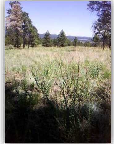
Same area restored through bio-control agents

may reflect changes that are the result of the previous year’s treatments. Also, not every treatment is monitored, so those activities that report a value of “no change” do not necessarily represent reality. Nevertheless, when taken as a whole across all years, the average “percent change” value can be a useful surrogate for the effectiveness of treatments. To determine the number of restored acres, we took the total acres accomplished and multiplied it by the average percent change value (which excludes the null values of treatments that were not monitored).