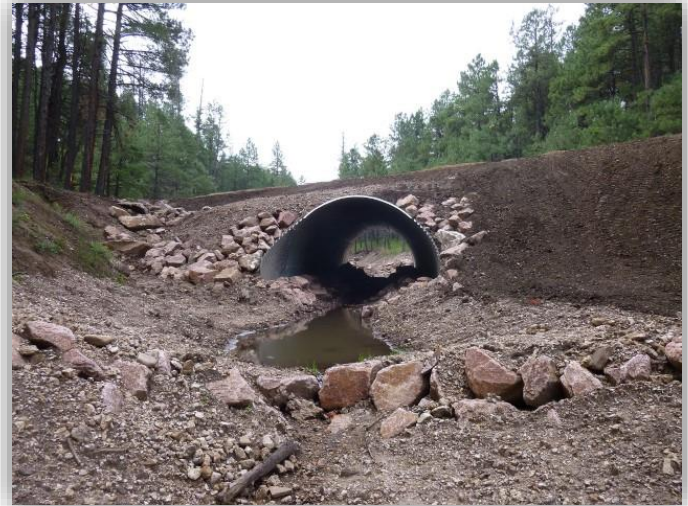
Aquatic Passage Installation

To determine if a project was completed in full compliance with the contract language or treatment guide, we evaluated contract records or interviewed those individuals who were directly or indirectly involved in the inspection and approval of the completed project work. In this way, we were able to identify any occurrences where contract specification/treatment instructions were not followed and also evaluate whether those failures resulted in an inability to achieve the project objectives. Based on our review, all completed projects resulted in measurable progress towards the project-specific desired conditions.