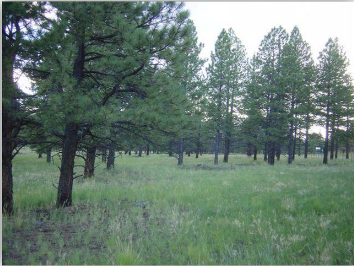
Restored herbaceous cover improves habitat quality for herbivores and raptors alike

species since these fires do not typically result in significant changes in canopy cover, but do improve the resiliency of the habitat.