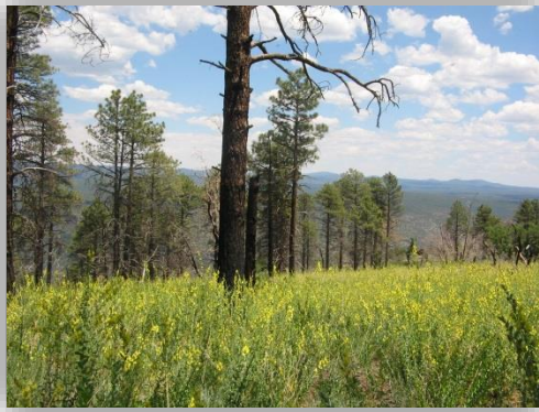
300-acre Dalmatian toadflax infestation

The first desired condition statement is based on the established relationship between increases in native understory cover and diversity and resilience of an area against invasive species establishment. To represent the effects of treatments that improve resilience, we took the vegetation treatments that resulted in canopy cover that is less than 40%. These are the treatments that are expected to result in a significant increase in understory cover.