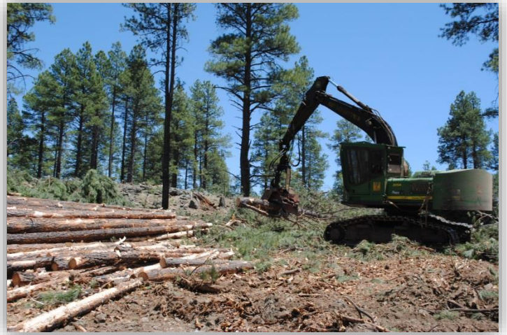
Restoration in Mountaineire

The boundaries for all restoration treatments were taken from the FACTS spatial database and displayed over an aerial photograph. The effect of each treatment was then visually categorized into groups based on canopy cover using a reference image where canopy was digitally calculated. The following assumptions were made based on well-established data derived from years of post-implementation monitoring, modeling, and practical breakpoints that describe broad trends: All treatments were assumed to have raised canopy base height (affects crown fire initiation). However, only those treatments that reduced canopy cover to below 40% were assumed to have reduced the risk of active crown fire. All prescribed fires and wildfires managed for resource benefit were assumed to have raised canopy base height and not to have significantly affected crown cover. All treatments were buffered by ¼ mile to capture the effect to areas immediately surrounding treatments. Where treatments or buffers overlapped, the overlap was subtracted to avoid double counting.