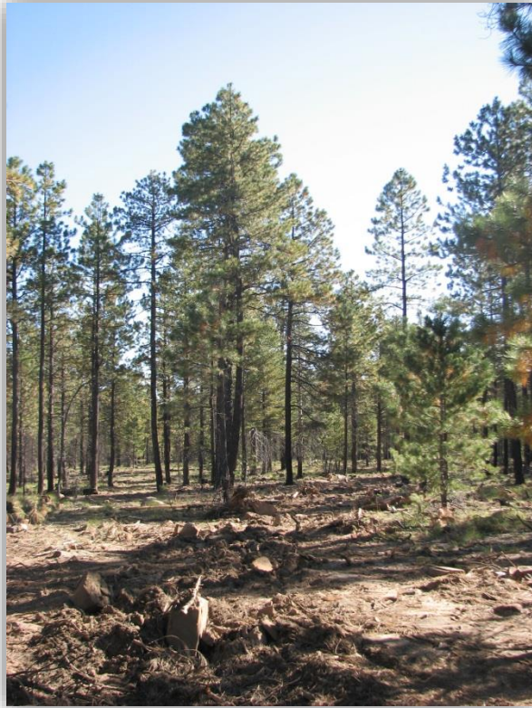
Road Decommissioning improves both habitat and watershed quality

reference rather than presented here. However, the implications are obvious. By sacrificing site-specific detail, we are able to capture the broader impact to the landscape and, in so doing, highlight one of the great values of landscape-scale restoration: strategically placed treatments can improve conditions across the entire landscape.