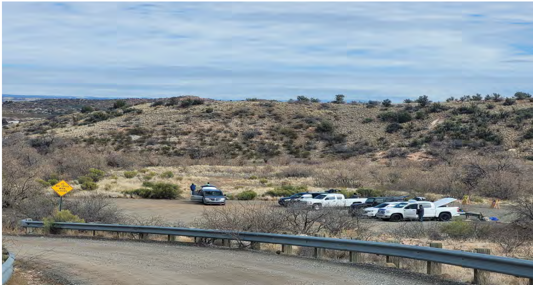
Image 2: Looking down at the dispersed recreational shooting area – homes in the background, far left.

Prior to 2012, the dispersed recreational shooting area was managed as general forest area (GFA) with no barriers to off highway vehicle use. In 2012 the Forest implemented several watershed action plans aimed at improving soils and watershed conditions. Given the proximity to the Verde River, it was chosen for site improvements. At that time the location of the dispersed recreational shooting area served as a hot air balloon launch for a permitted outfitter. Within the Black Canyon Watershed Action Plan several activities were implemented to recover the denuded area from illegal OHV (Off-Highway Vehicle) use and recreational shooting activities. Fencing was constructed along the service road to the river to prevent off road travel and was cleaned up, seeded, and mulched and a small parking area was constructed with boulders and guardrail to allow parking for general Forest access and continuation of the hot air balloon service. The parking area barriers successfully restricted motorized travel into the GFA in compliance with travel management regulations. Since then, however, recreational shooters have used the barriers as an improvised firing line with targets set up just beyond the barriers, shooting mostly east and parallel with State Route 260. When the dispersed recreational shooting area begins to fill up, shooters have been observed firing more north / northeast in the direction of Black Canyon Day Use Site and homes on the Northeast side of the Verde River.