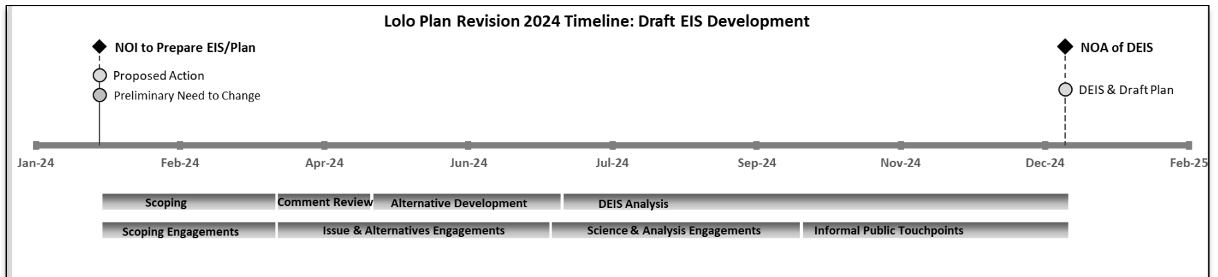
Figure 2: Lolo Plan Revision 2024 Timeline (Draft Environmental Impact Statement Development)