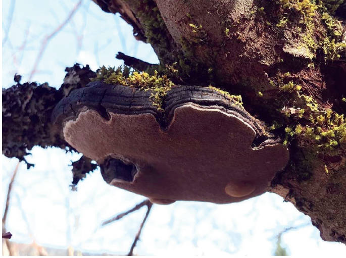
Figure 9. An uncommon Phellinus sp. conk on willow at Pt. Bridget State Park north of Juneau.