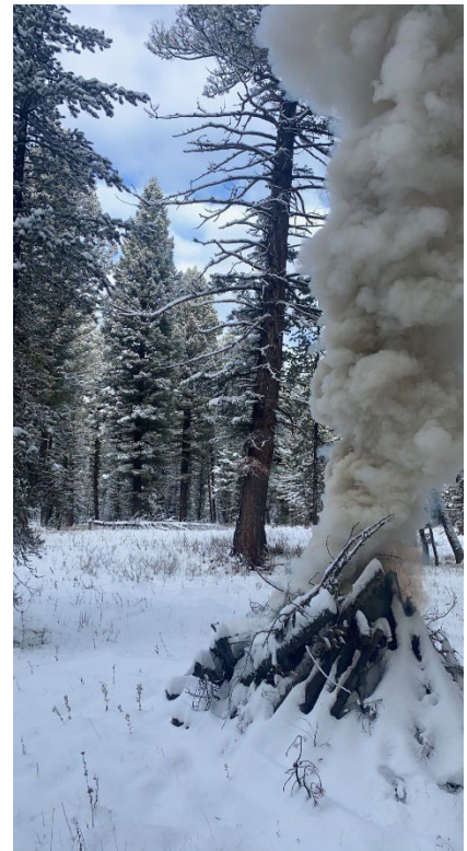
Figure 1: Pile burning near Island Park October 2021.

Predicting the actual day of a prescribed fire is difficult due to weather and fuels conditions. Therefore, on the actual day of ignition, orange highway signs will be posted along Forest roads or Highway 20 to inform residents & visitors of the planned ignition that day. Additionally, approval from the Idaho/Montana smoke monitoring agencies is required, to reduce the impact of smoke on air quality. Smoke may be visible from the surrounding areas including Highway 20. Updates will be posted to the Forest’s Facebook page at USFSCaribouTarghee .