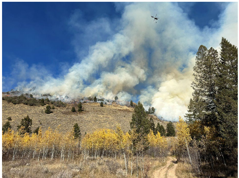
Figure 1: Prescribed Burn operations in Teton Canyon, October 18, 2022