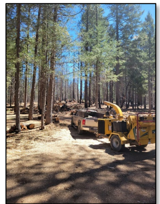
Falling and Chipping Crews at Pine Mountain Lookout Rental Cabin

Drought conditions and beetle flights resulted in thousands of trees dyeing in and around recreation sites. Dead and dyeing trees of all sizes were felled and bucked into firewood for campers. These treatments will contribute to future forest health and protect users and infrastructure at the sites. $20,000 in fleet, employee costs, and micro purchases were covered by recreation fees to partially fund hazard tree removal at Middle Creek Campground, Deer Valley Campground, Penny Pines Campground, Pine Mountain Lookout Rental Cabin, and Letts Lake Campground.