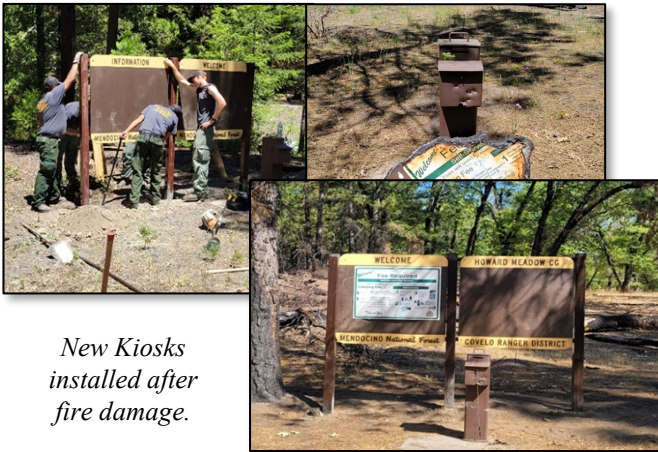
New Kiosks installed after fire damage.

The forest spent $15,000 dollars in campground fees to partially fund replacement of fee station kiosks at Howard Meadow Campground, Little Doe Campground, and Eel River Campground. These kiosks were burned and damaged in the August Complex Fires. They are essential in explaining payment information for the fee sites as well as disseminating important Forest Information.