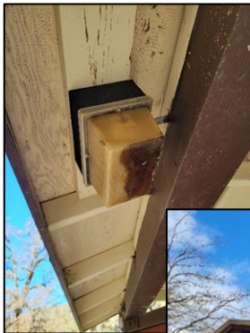
Before and after new LED light installation

The forest replaced old kiosks and bathroom lights at Middle Creek Campground. These new LED lights will reduce carbon emissions and utility costs through light sensors and more efficient technology and help the campground meet accessibility guidelines.