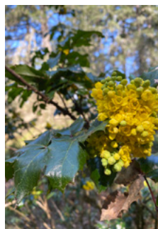
Dwarf Oregon Grape