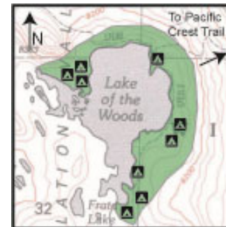
Lake of the Woods

The popularity of some wilderness destinations results in damage to the delicate vegetation around shorelines and meadow areas. Restoration has occurred and campsites have been designated around several heavily impacted lakes to promote re-vegetation and reduce impacts to these sensitive lakeshore environments. These maps illustrate the approximate locations of the designated sites.