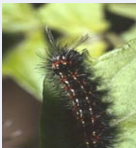
Damage caused by Pareuchaets pseudoinsulata .