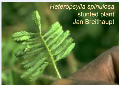
Heteropsylla spinulosa stunted plant