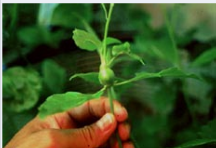
Damage of Siam weed caused by the gall fly, Cecidochares connexa