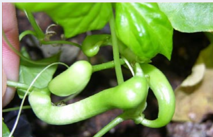
Galls on ivy gourd caused by the larvae of Acythopus burkhartorum .