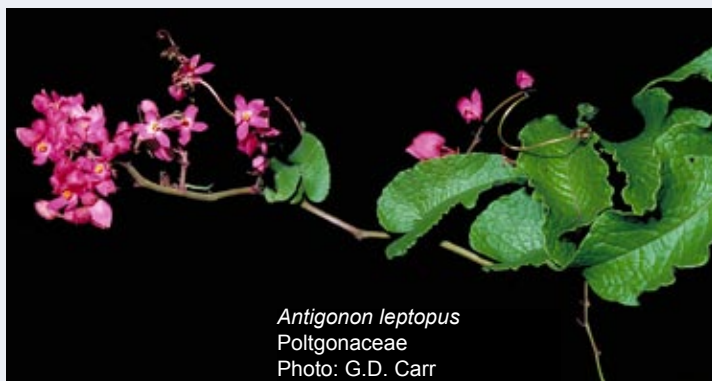
Antigonon leptopus Poltgonaceae