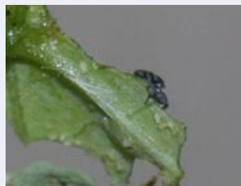
Adult A. cocciniae