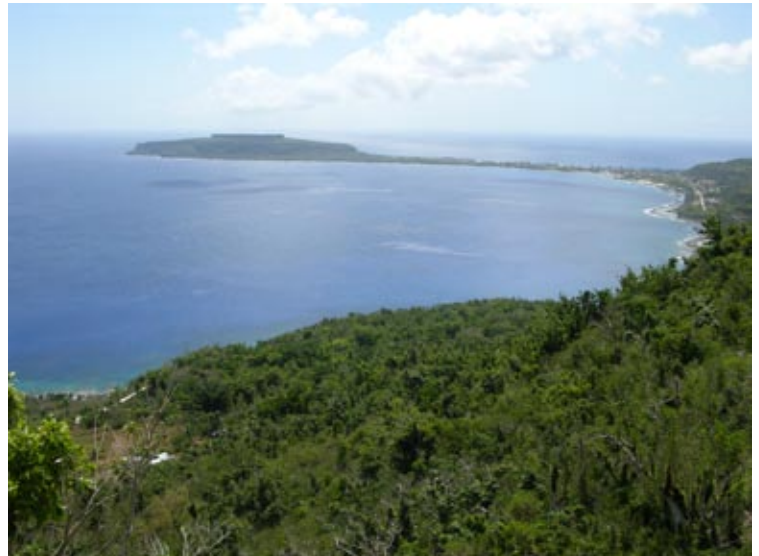
Native vegetation of Rota.

Typhoons are a regular feature in most of the Pacific. Guam and the CNMI are regularly struck by typhoons; the other islands also experience severe storms from time to time. However typhoon frequency and severity are expected to increase with global climate change. From 2001 to 2004, with the aid of Forest Health Protection Prevention and Suppression funding, Yap made significant progress in eradicating a localized infestation of Imperata cylindrica (cogon grass). In 2005, the disturbance from Typhoon Sudal and the need to divert all island resources to basic recovery efforts resulted in a major setback in the attempt to eradicate cogon grass.