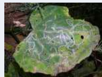
Larval mines caused by A. cocciniae