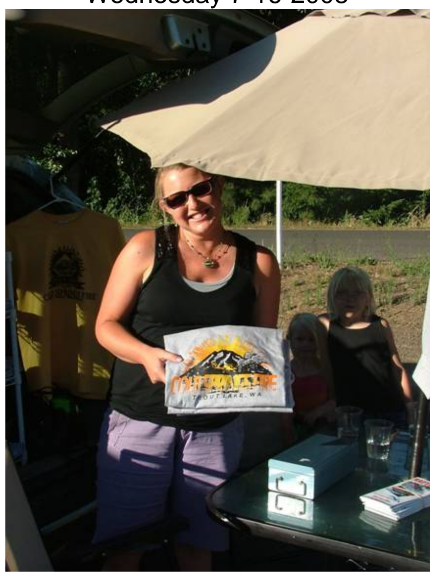
Trout Lake is OPEN FOR BUSINESS!!