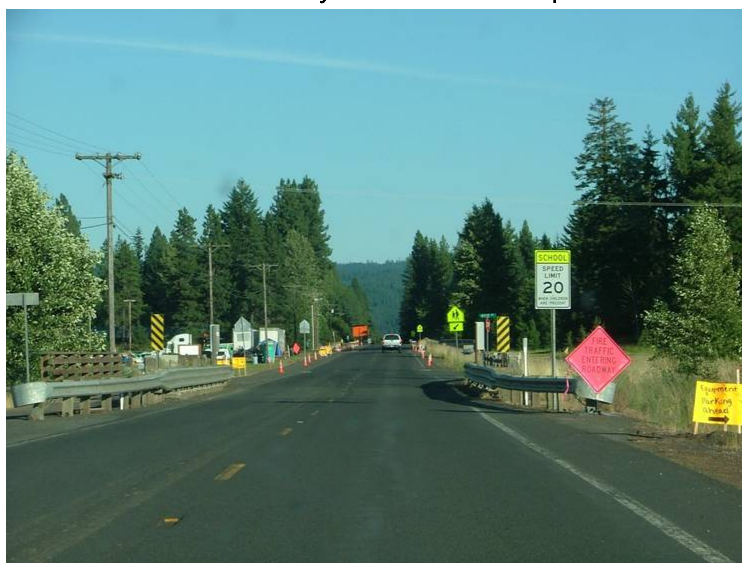
BE SAFE ON HWY 141!!