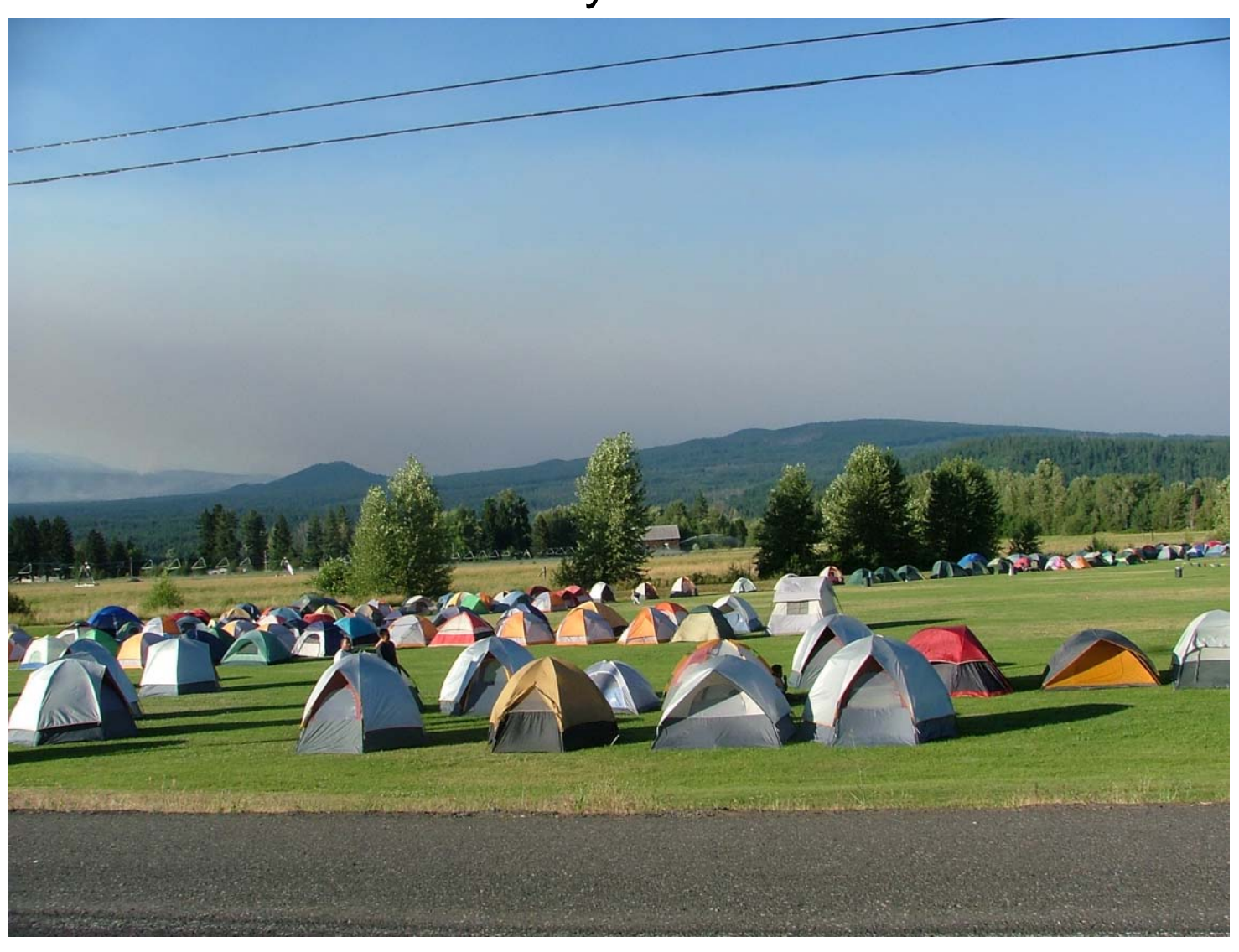
Fire Camp at the Trout Lake School