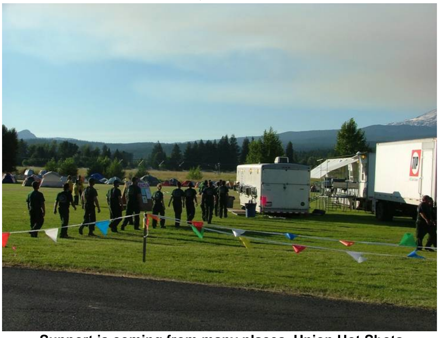
Support is coming from many places, Union Hot Shots