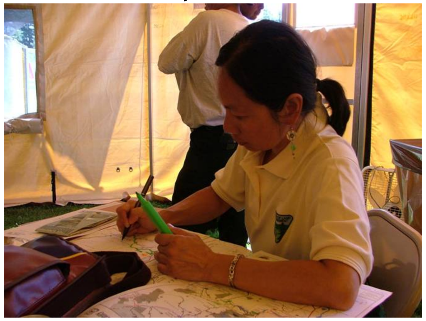
A Type 2 Incident Mgmt. Team from Central Oregon is managing the fire