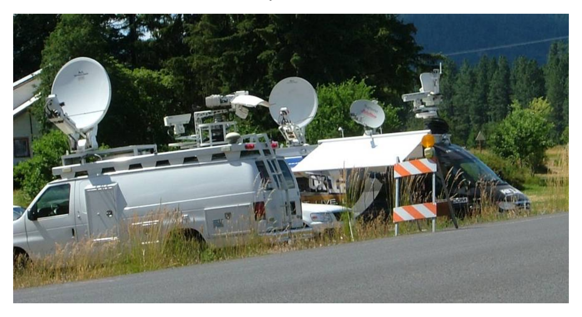
Heavy interest from NW and National Media