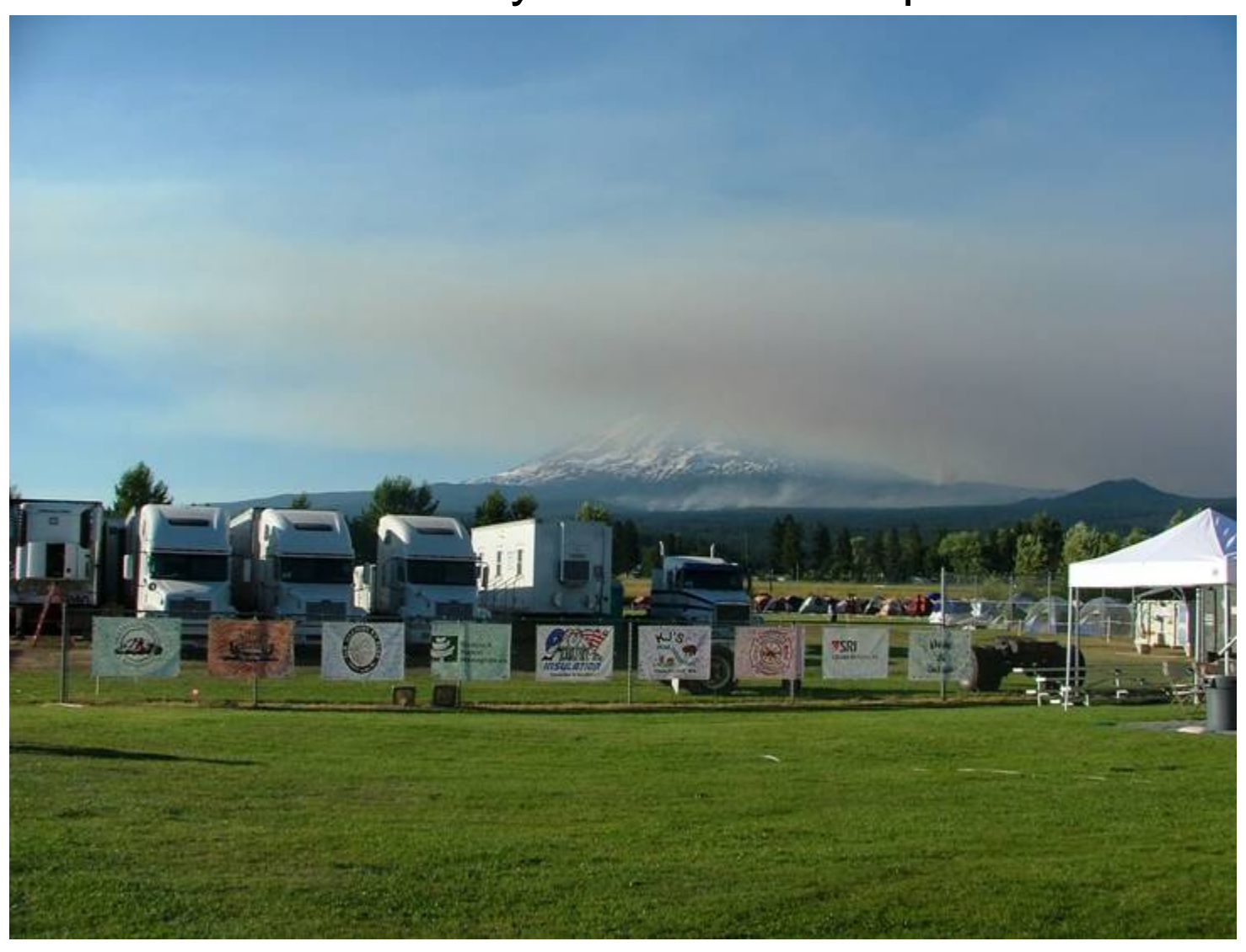
Fire Camp at the Trout Lake School