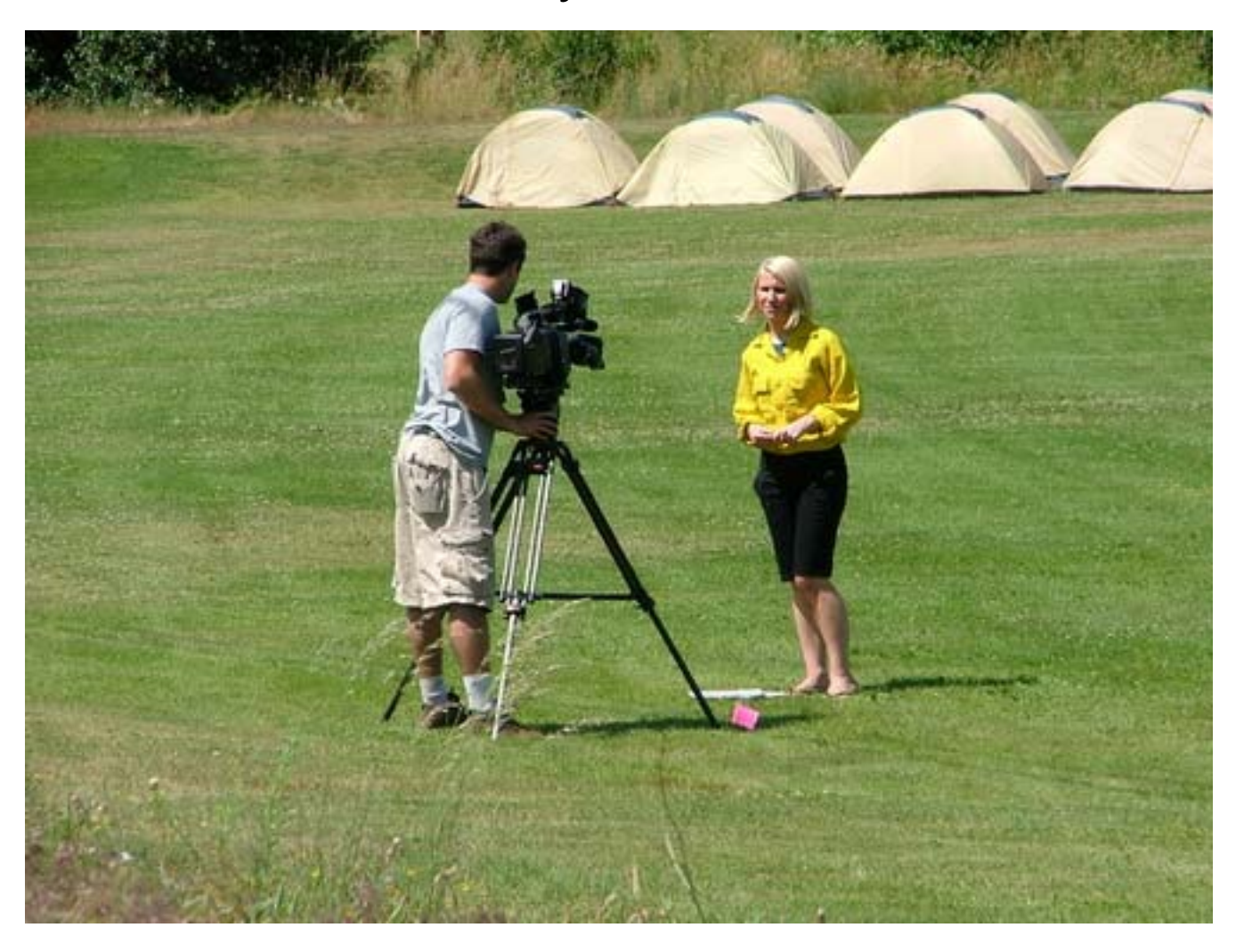
Heavy interest from NW and National Media