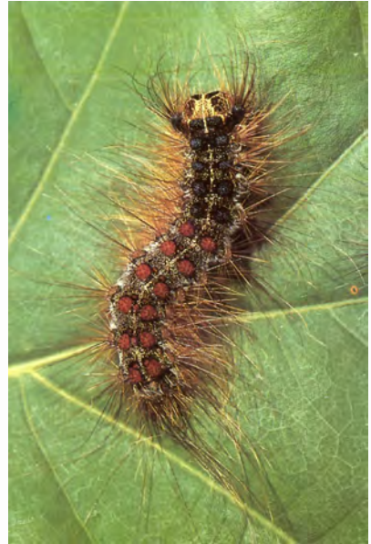
Figure 5 — Older gypsy moth larvae showing five pairs of raised blue spots and six pairs of raised brick-red spots.

tween mid-June and early July. They enter the pupal stage (fig. 8). This is the stage during which larvae