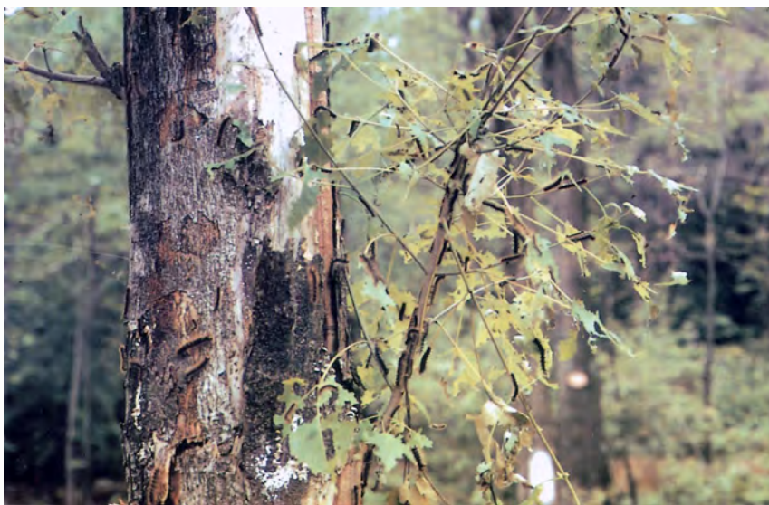
Figure 7 — A tree stripped by gypsy moth larvae.

Four to six weeks later, embryos develop into larvae. The larvae re- main in the eggs during the winter. The eggs hatch the following spring.