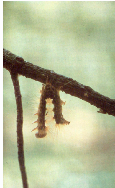
Figure 13—Larvae infected by the nucleopolyhedrosis virus (NPV) hanging in an inverted "V" position.

Wilt disease caused by the nucleopolyhedrosis virus (NPV) is specific to the gypsy moth and is the most devastating of the natural diseases. NPV causes a dramatic collapse of outbreak populations by killing both the larvae and pupae. Larvae infected with wilt disease are shiny and hang limply in an inverted "V" position (fig. 13).