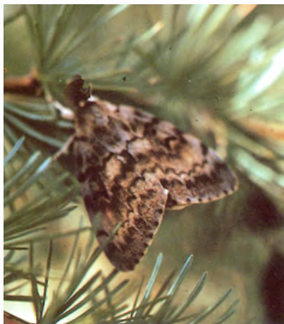
Figure 9— Male gypsy moth.