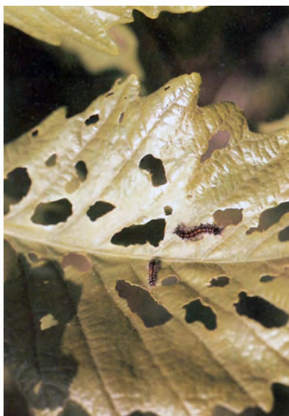
Figure 6 — First instar gypsy moth larvae chewing small holes in leaves.

change into adults or moths. Pupa- tion lasts from 7 to 14 days. When population numbers are sparse,