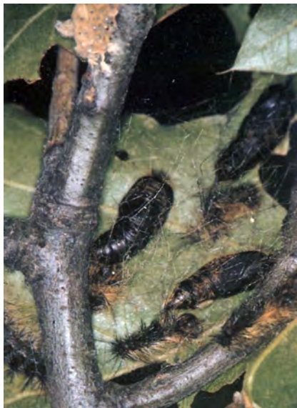
Figure 8— Gypsy moth pupa.