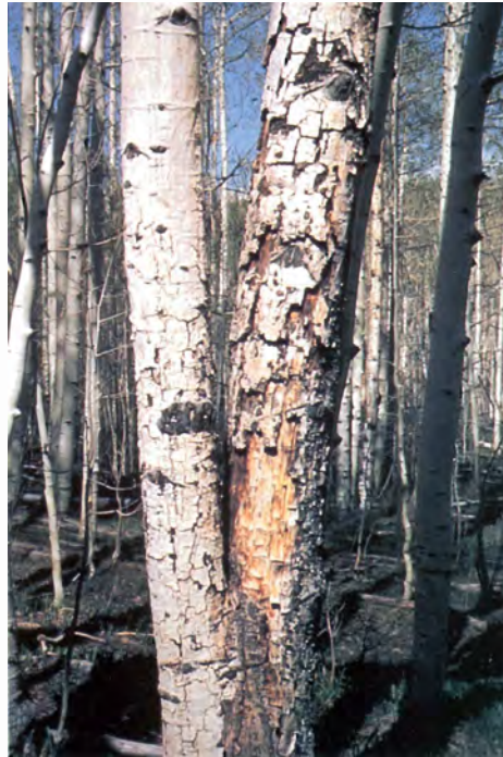
Figure 9 – Hypoxylon canker showing checkered bark.

The only practical control for canker diseases is to avoid wounding residual stems during stand entries. Infection of wounded live trees, and subsequent tree mortality can increase dramatically in managed stands. In one study in Colorado and New Mexico, 20% of residual trees in partially cut stands died 5 years after the stand was harvested. Trunk cankers developing from infected logging injuries were the major cause of tree death. Two years later, 40% of the remaining residual trees were infected