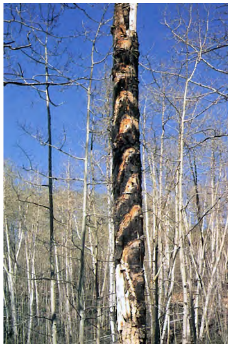
Figure 3 – Sooty-bark canker exhibiting characteristic barber pole pattern of infection.