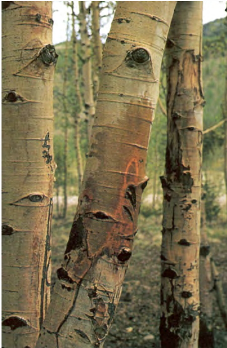
Figure 8 – Cytospora canker showing irregular pattern of infection and orange discoloration of bark tissue.

The first indication of infection is the orange discoloration of the bark surrounding the wound. After infection,