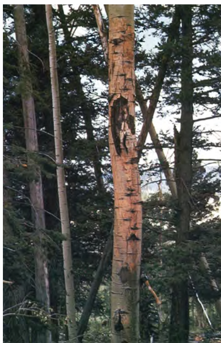
Figure 5 – Cryptosphaeria canker exhibiting the typical snakelike pattern of infection.

Flask-shaped fruiting bodies, called perithecia , develop beneath bark dead for more than 1 year. The perithecia release spores during wet periods. These spores colonize wounds, establishing the fungus at a new site. Light-orange-colored fruiting structures, called acervuli , of the asexual state of the fungus ( Libertella sp.) are occasionally found along the edges of the canker.