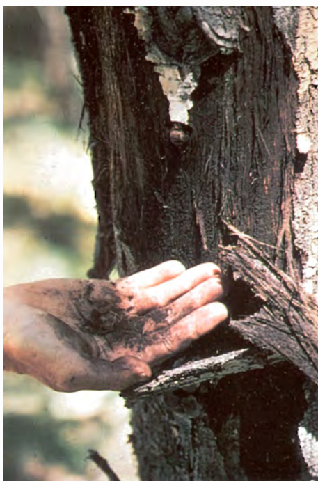
Figure 2 – Sooty residue from infected bark tissue.

The fungus infects trees through wounds and invades the inner bark and cambium. Cankers develop rapidly, extending as much as 1 m (3 ft) in length and .3 m (1 ft) in width in a year. However, the mean annual extension vertically is .4 m (18 in) and .2 m (6 in) horizontally. Young cankers first appear on the bark as sunken oval areas. Formation of callus around canker margins is unusual, as host tissues are rapidly colonized by the fungus. The bark killed each year by the fungus is readily apparent and begins to slough after 2 or 3 years, exposing the blackened inner bark. This dead inner bark, which crumbles to a soot-like residue in one's hand, is the origin of the common name of this canker (figure 2). The outer bark sloughs faster in the central portions, giving the canker a "barber pole" appearance (figure 3). Eventually the bark falls off in long stringy strips,