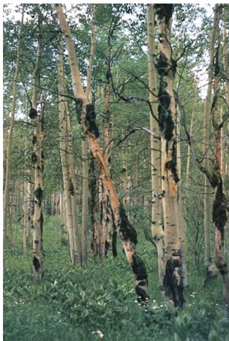
Figure 1 – Aspen stand with trees damaged by black canker.

Aspen reproduces primarily by means of root suckers produced from buds on shallow roots. Over much of its western range, quaking aspen is a small to medium-sized, fast-growing, and generally short-lived tree. The species reaches its most splendid development in the Rocky Mountains of southern Colorado and northern New Mexico, where some individual trees can attain diameters of up to .9 m (3 ft) and a height of 30.5 m (100 ft), and often live for more than 150 years. However, average trees are considerably smaller and many stands begin to deteriorate after 80 years.