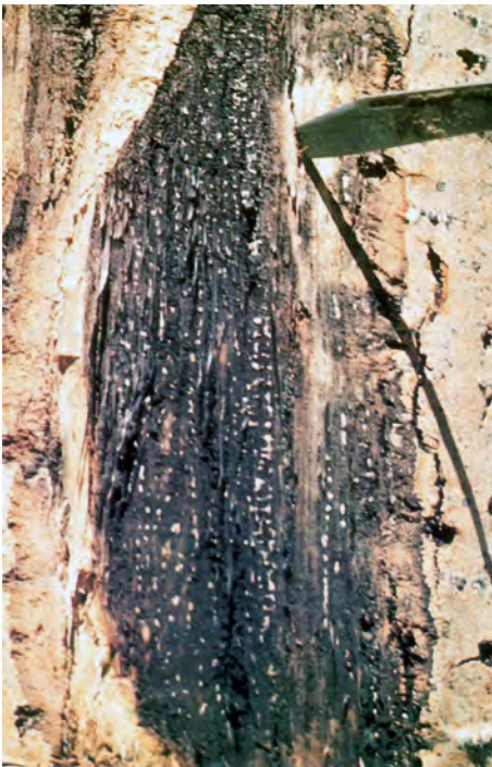
Figure 6 – Lens-shaped, light-colored areas within infected bark tissue on a cryptosphaeria canker.

Perithecia are formed in the spring along the border of the canker on tissues dead at least a year, although