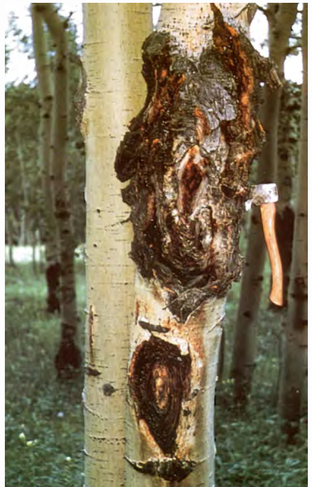
Figure 7 – Black canker showing large callus folds.