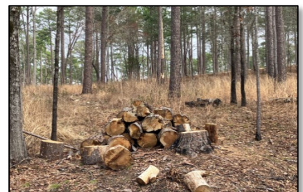
Hazard tree removal around recreational areas improves safety for visitors

Maintaining underbrush and hazardous tree removal are key components in maintaining forest health and safety standards at recreation sites across the National Forests in Alabama. These activities are accomplished by using Forest Service employees and tree service contractors to remove hazardous trees. $2,500 of recreation fee funds collected were used for this project in 2022.