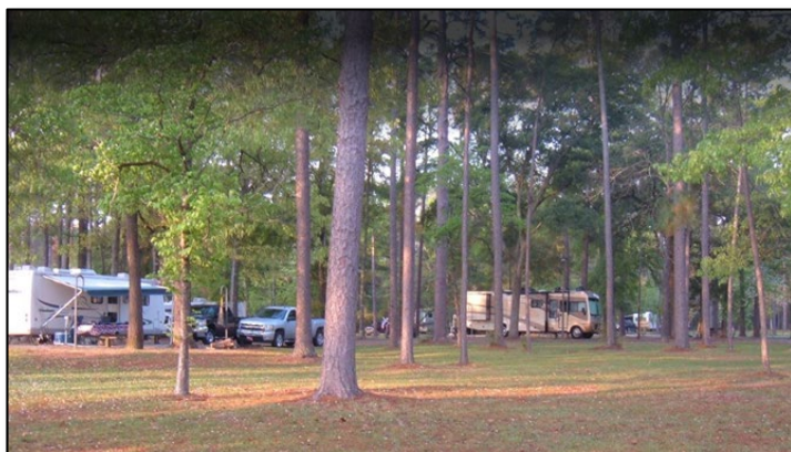
Open Pond Campground provides a peaceful setting for visitors to relax and enjoy the outdoors