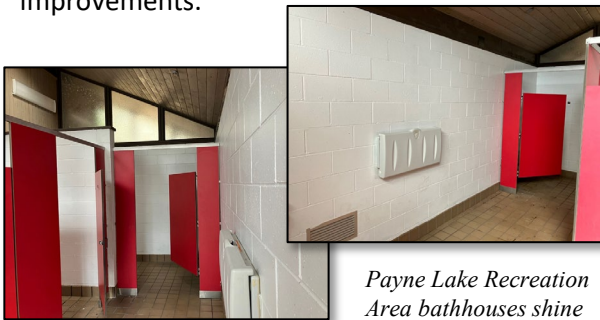
Payne Lake Recreation Area bathhouses shine with new LED lighting and fresh paint

The bathhouses at Payne Lake Recreation Area are just one of the great amenities available to visitors. In 2022, new LED lighting with sensors were installed, reducing electrical expenses while still providing light during evening and early morning hours. Freshly painted surfaces throughout the bathhouses provided an extra shine. This helps with cleaning and maintaining the facilities to a high standard. Some windows were replaced with new Lexan material to provide for more durability. Recreation fee funds in the amount of $1,850 were used to complete these improvements.