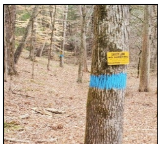
New signage and paint mark the safety zone established at Brushy Lake Recreation Area