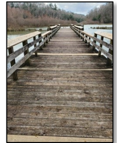
Brushy Lake Recreation Area pier improvements included replacing rotten boards and installing new upper top rails