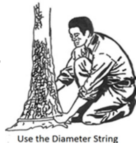
Use the Diameter String

Portions of wood that have been cut and not used (slash), will be cut and scattered to no more than 24 inches off the ground.