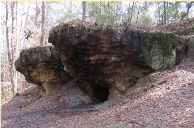
Wolf Rock Cave