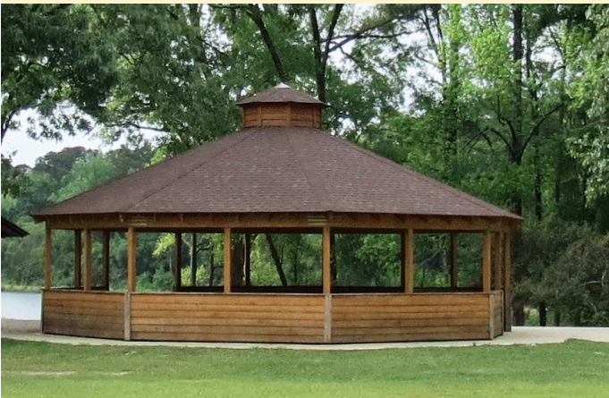
Pavilion at Fullerton Lake Recreation Area

Calcasieu Ranger District 9912 Highway 28 West Boyce, Louisiana 71409 Phone: (318) 793-9427 or 1-(800) 225-9733 www.fs.usda.gov/kisatchie OHV Hotline: (318) 473-7069 Hours: 7:30 a.m.—4:00 p.m. M-F