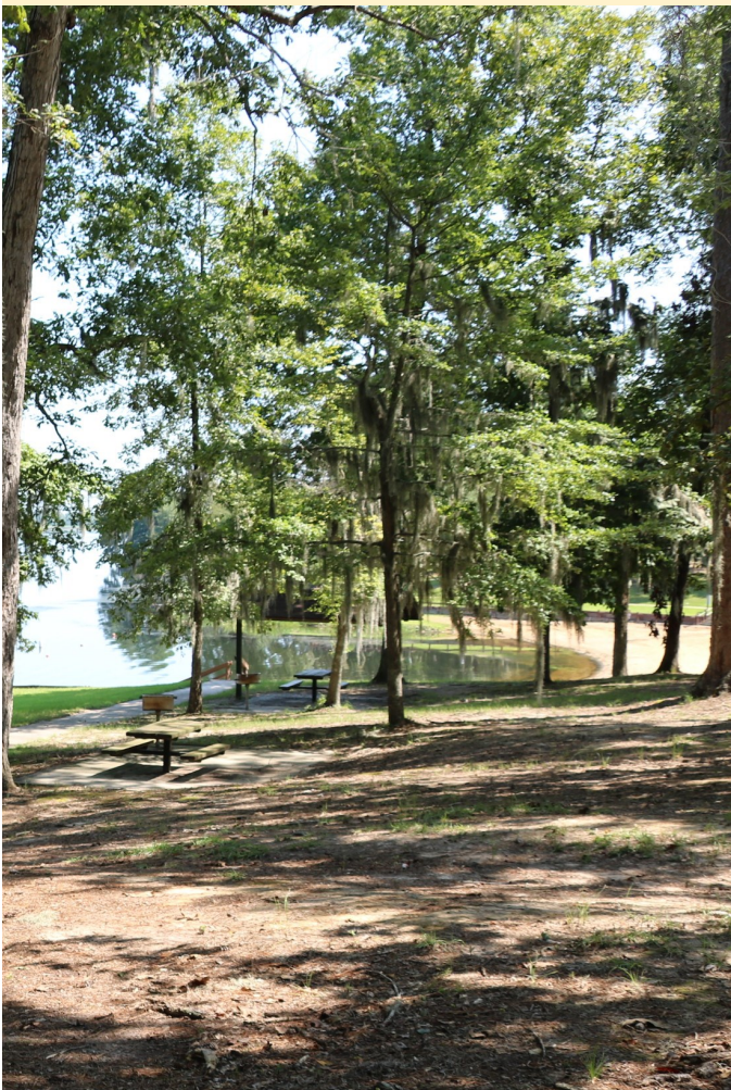
Kincaid Lake Day-Use Area

Calcasieu Ranger District 9912 Highway 28 West Boyce, Louisiana 71409 Phone: (318) 793-9427 or 1-(800) 225-9733 www.fs.usda.gov/kisatchie OHV Hotline: (318) 473 - 7069 Hours: 7:30 a.m.—4:00 p.m. M-F