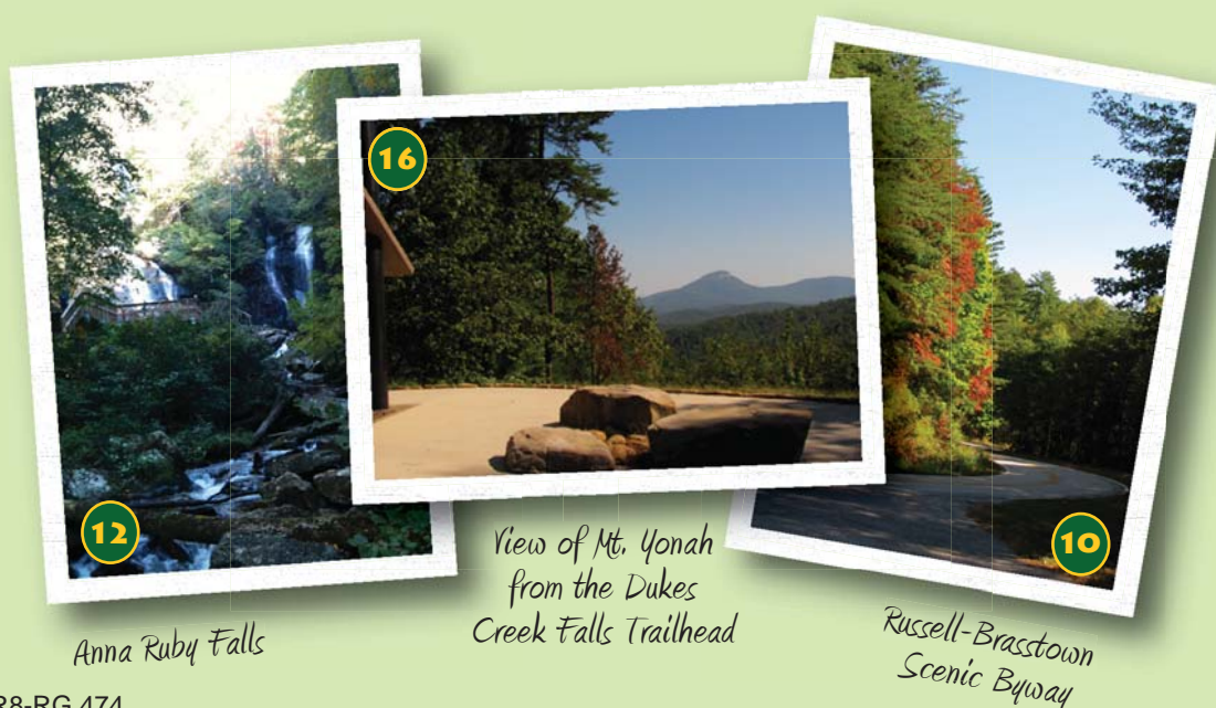
Anna Ruby Falls

Cool in the summer, mild in the winter, the Russell-Brasstown Scenic Byway encircles the headwaters of the Chattahoochee River and is surrounded by the Chattahoochee National Forest. The drive is ideal for viewing colorful wildflowers or dazzling fall color. Secluded valley views of Wilderness Areas abound along the way. Stretch your legs at Dukes Creek Falls 16 , where a mile-long hiking path delivers you to a misty poolside below a cascading waterfall. Keep an eye out your window for views of Mount Yonah's 14 prominent cliff face in the distance. Cross the famed Appalachian Trail at Hogpen Gap. Linger atop Brasstown Bald 9 , Georgia's tallest mountain, to absorb all 360-degrees of rolling highlands and learn more about the area at the visitor center there. Hike or bike at Smithgall Woods State Park 15 to explore hardwoods, trout streams and watch for wildlife. A rustic haven of cottages, campsites, lodge rooms and trails, is easily accessible from the byway at Unicoi State Park 13 . Stroll up the 0.4-mile paved path to Anna Ruby Falls 12 , and see where two creeks converge in the rare, 150-foot twin falls. Share a meal at a cozy picnic site along the way, or break bread in Helen, a Bavarian-themed hamlet located near the byway. The 40-mile loop follows State Highways 348, 180, and 17/75. Allow at least three hours driving time.