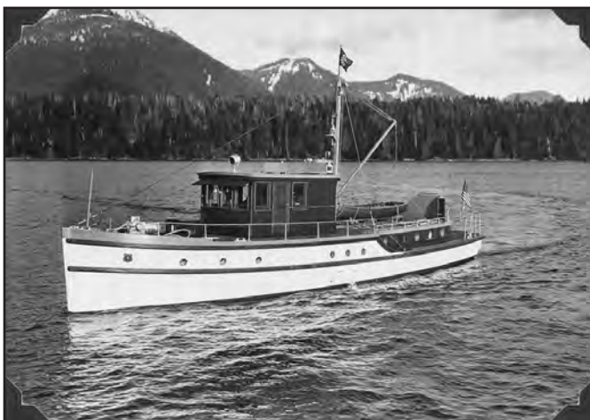
Ranger Boat 9