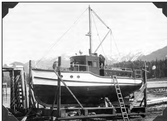
Ranger Boat 1, 1925