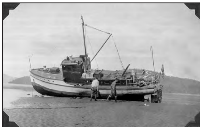
Ranger Boat 6