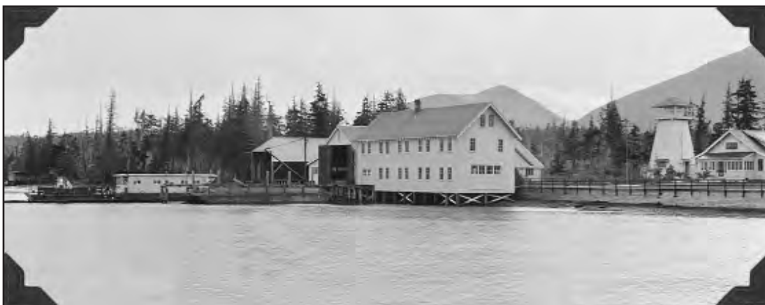
Forest Service marine station at Clam Cove, Gravina Island, 1936