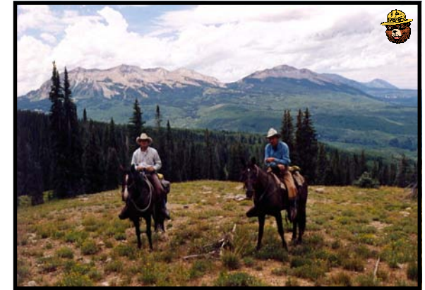
Oh-Be-Joyful Pass Paonia R.D.

Total Length 8.4 Miles 3.2 Miles on the Paonia R.D. 5.2 Miles on the Gunnison R.D.