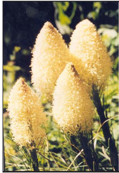
Beargrass blooms from May to August in open woods and clearings.

To enjoy the vistas and solitude, an ideal trip in the Magruder Road corridor will last at least two days with an overnight stay at one of the six primitive campgrounds. Hikers, backpackers, mountain bikers, stock users, and motorcyclists will find a dizzying array of adventure options.