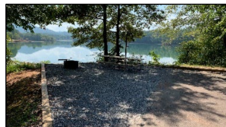
Recently reconstructed campsite at Jackrabbit Mountain