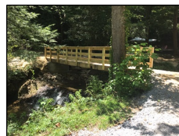
New trail bridge construction at Mortimer Campground

a variety of campers to enjoy, from tent only to vans or small RVs. Additionally, the forest reconstructed a critical footbridge in the campground that was destroyed by a flood in May of 2018. The new bridge crosses Thorps Creek to access three walk-in campsites. Concrete piers were poured and anchored to a solid rock base with oak bridge timbers cabled together for bridge tread.