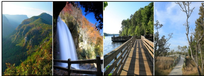
The forests stretch from the mountains to the coast