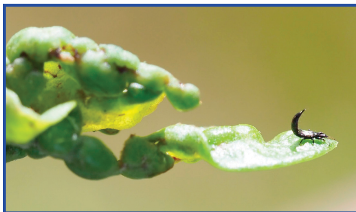
Figure 2. Myoporum thrips and its damage to native naio.

There is no common name for Acalolepta aesthetica , which has been dubbed the Queensland Longhorn beetle, a reference to its native habitat in that region of Australia. The beetle is damaging trees including cacao, Queen sago palm, citrus, breadfruit, and kukui. A single adult Acalolepta aesthetica was first collected on the window screen of a resident of Hawaiian Acres, Puna, Hawai'i in 2009. Additional beetles were not recovered until 2013, and the first signs of damage to host trees were not discovered until 2014. Recently, there have been numerous detections of attacks on trees in some areas of the Big Island. Recent information indicates the beetle may have spread to Pahoia, Hawaiian Beaches and Hilo. The beetle is not a pest in Australia, so there is little information available on its biology and management. Signs and symptoms of infestation include sap oozing at oviposition sites, girdling on the trunk, wood boring particles being pushed out of holes on the trunk, round exit holes about 1/2" across, and branch dieback and breakage.