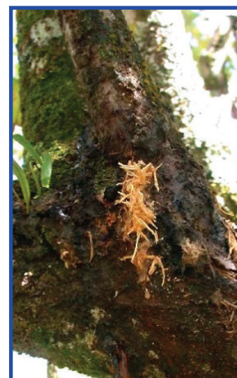
Figure 4. Acalolepta aesthetica wood boring particles being pushed out of a tree.