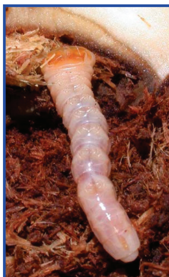
Figure 3. Acalolepta aesthetica larva.