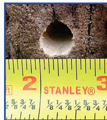
Figure 5. Acalolepta aesthetica adult beetle exit hole.