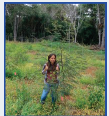
Figure 1. Forward Selection Seedling Seed orchards of Acacia koa , like this one at Kokee, Kauai, were established using seed from koa families which had previously been tested and found to be resistant to the wilt fungus Fusarium oxysporum .

A major leap forward was made in 2019 as several of the Forward Selection Seedling Seed Orchards of Fusarium oxysporum -resistant Acacia Koa received their final evaluation and roguing. In 2019, these orchards produced over 50,000 seeds. In the future, they will deliver much greater numbers of seed. In addition to being resistant to F. oxysporum , trees grown from these seeds can be expected to grow faster, have better form, and produce wood with high-value character. Interest in growing koa for commercial and restoration purposes has been greatly increasing in Hawai'i.